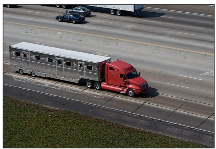
Horses are on the move this month!

Shipping fever is a pulmonary disorder associated with shipment. Studies indicate that the stress response is at fault, resulting in a higher level of ACTH (and therefore cortisol), glucose and white blood cells. The longer the transit time is, the greater the stress response, with pneumonia and pleuropneumonia being potential consequences of a long shipment.