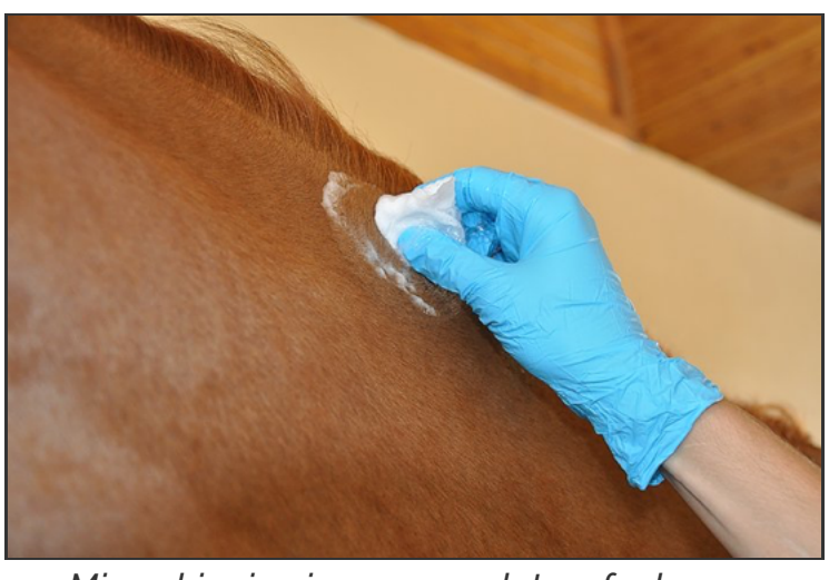
Microshipping is now mandatory for horses competing in classes that require United States Hunter Jumper Association (USHJA) registration

The United States Equestrian Federation (USEF) now requires horses and ponies to be microchipped with an ISO 11784/11785 compliant chip to compete in classes that require United States Hunter Jumper Association (USHJA) registration. The microchip verifies a horse's ID, which allows the horse to compete for points and prize money and to be eligible for certain USEF and USHJA programs and awards.